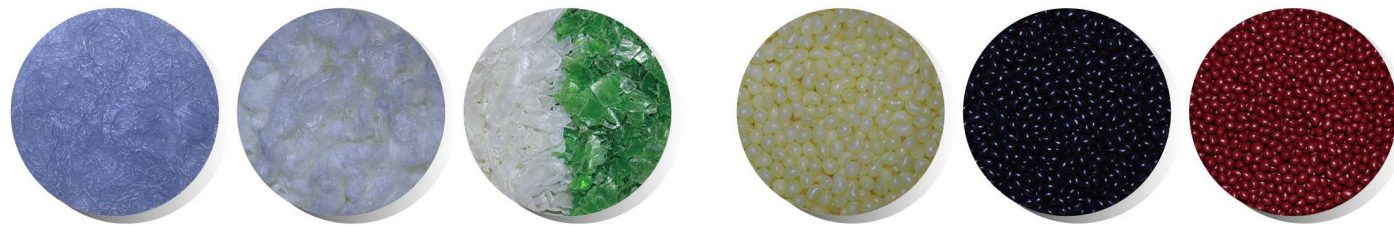
高濃度母粒 High percentage master batch

世洲機械工藝一直走在台灣尖端，因應市場需求並針對節能減碳的世界潮流所開發的最新設計：