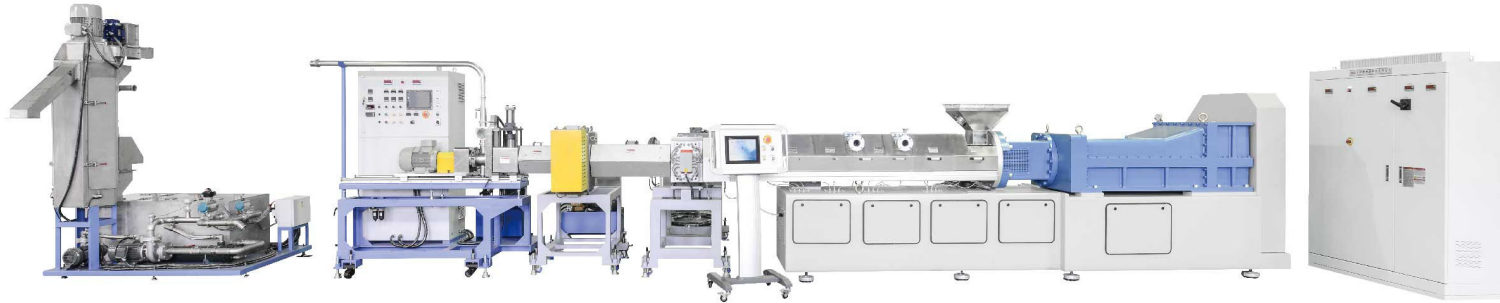
回收物 Recycle materials